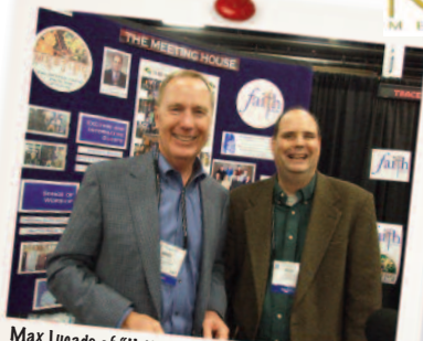
Max Lucado of "UpWords" stopped by to discuss God's grace, as well to provide encouragement for navigating life's challenges with a sense of hope in Him.