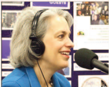
Nancy Leigh DeMoss of "Revive Our Hearts" brought encouragement for women as they seek to walk in the Biblical definition of what it means to be a "true woman."